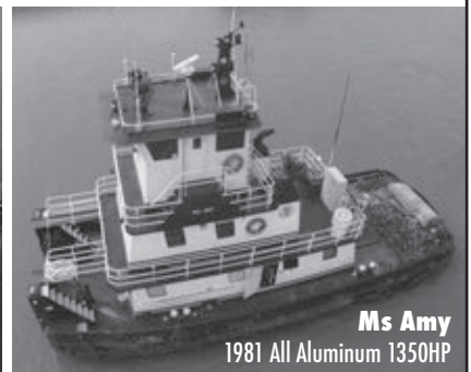
Ms Amy 1981 All Aluminum 1350HP