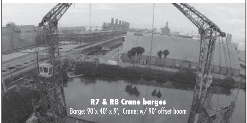
R7 & R8 Crane barges Barge: 90'x 40' x 9', Crane: w/ 90' offset boom

Additional : 3 small tank barges for sale that can be converted to deck barge.